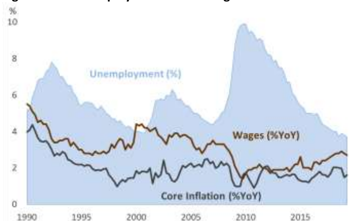
Figure 1: US Unemployment versus Wages & Core Inflation