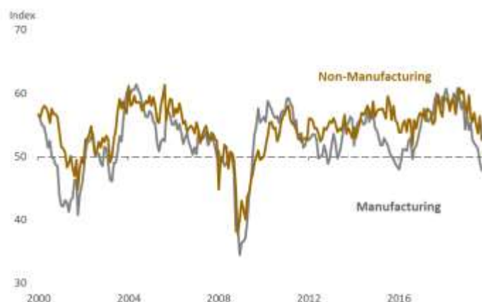
Figure 2: US ISM Surveys